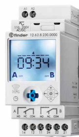
2 CO (DPDT) 16 A