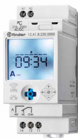
1 CO (SPDT) 16 A