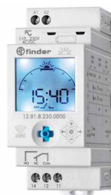
1 CO (DPDT) 16 A