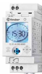
1 CO (DPDT) 16 A