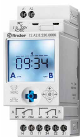
2 CO (DPDT) 16 A