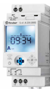
1 CO (SPDT) 16 A

Applications: Municipal lighting (street, squares, monuments, fountains...), gardens, parking, shops, illuminated signs, irrigation systems, heating and cooling plant.