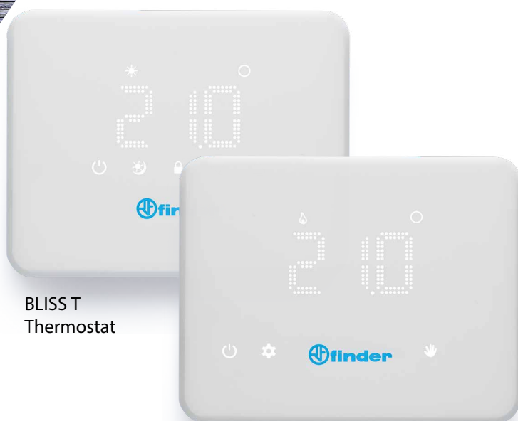
BLISS T Thermostat